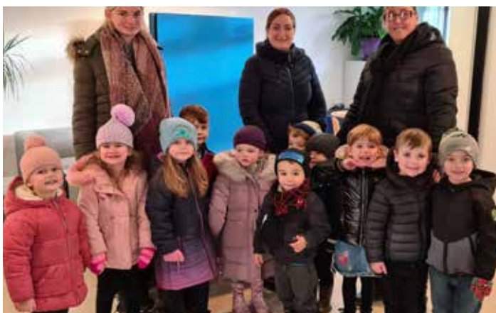
Children from Fallahill Nursery visiting The Hub with food donations they had collected

The Fauldhouse and Breich Valley Community Development Trust is guided by its Memorandum and Articles of Association.