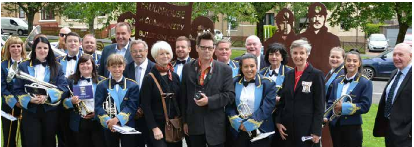
The launch of the Fauldhouse Mining Tribute