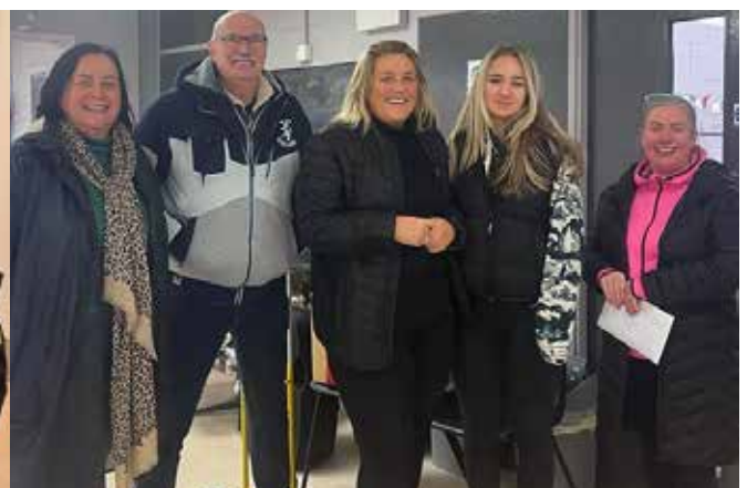
Just a few of our army of volunteers who delivered the Christmas Hampers and toys