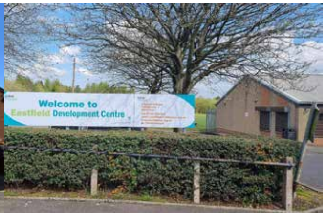
Eastfield Development Centre, 2 Eastfield Road