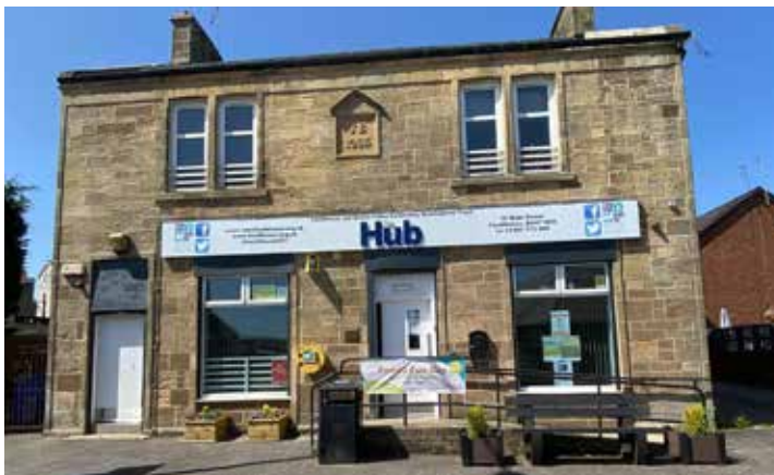
The Hub, 10 Main Street