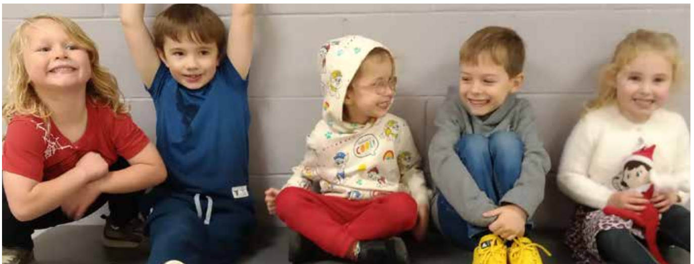
Children from the EDC Mini Youth Club